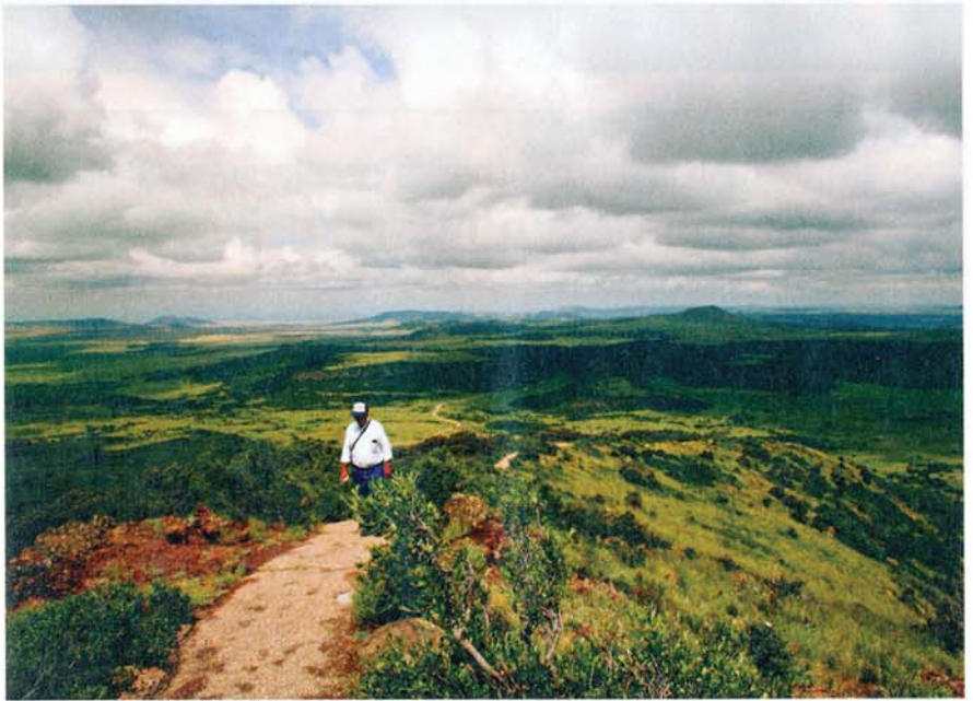
Volcano views: Walk the one-mile Crater Rim Trail to get up close to Capulin Volcano.